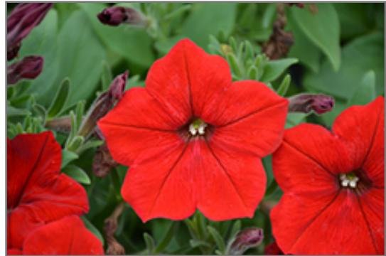
Easy Wave Red Petunia flowers

This plant will require occasional maintenance and upkeep. Trim off the flower heads after they fade and die to encourage more blooms late into the season. It is a good choice for attracting hummingbirds to your yard, but is not particularly attractive to deer who tend to leave it alone in favor of tastier treats. It has no significant negative characteristics.