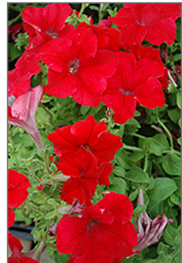
Dreams Red Petunia flowers