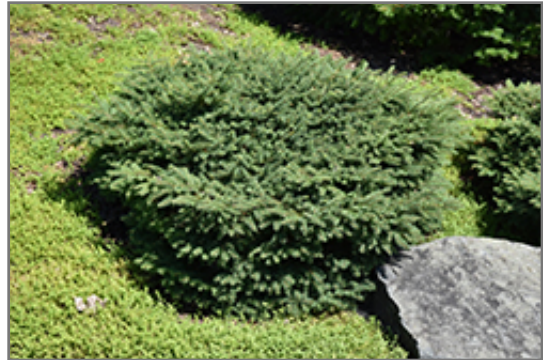
Birds Nest Spruce