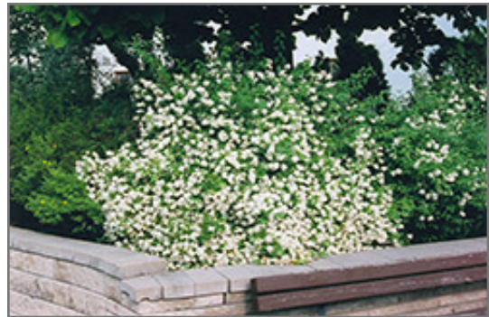
Galahad Mockorange in bloom