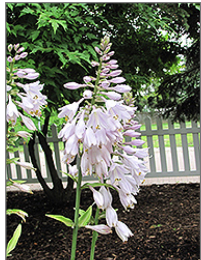
Key West Hosta flowers

7800 Roblin Boulevard Headingley, MB R4H 1B6