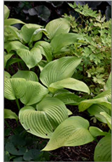
Key West Hosta

This plant does best in partial shade to shade. It prefers to grow in average to moist conditions, and shouldn't be allowed to dry out. It is not particular as to soil type or pH. It is somewhat tolerant of urban pollution. This particular variety is an interspecific hybrid. It can be propagated by division; however, as a cultivated variety, be aware that it may be subject to certain restrictions or prohibitions on propagation.