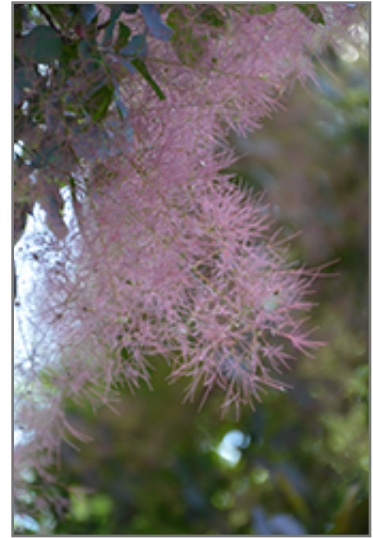
Royal Purple Smokebush flowers

At Shelmerdine, we treat this plant as a "HOBBY PLANT" meaning that it is not recognized as winter-hardy in our Zone 3 climate. However, there is a possibility that it could survive winter. Regardless of whether it survives a winter or not, this plant is only warrantied until Nov. 1 of its season of purchase.