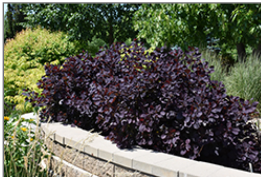
Royal Purple Smokebush