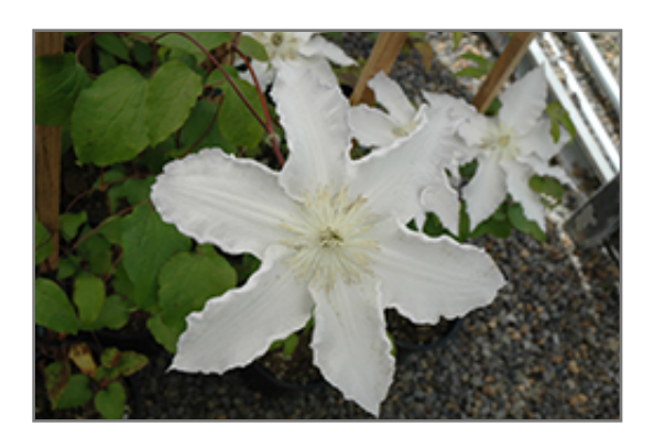
Gillian Blades Clematis flowers