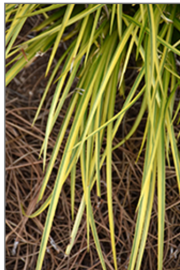
EverColor Everoro Japanese Sedge foliage

EverColor Everoro Japanese Sedge is recommended for the following landscape applications;