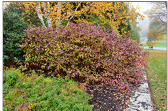
Red-Twig Dogwood in fall