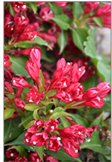
Crimson Kisses Weigela flowers