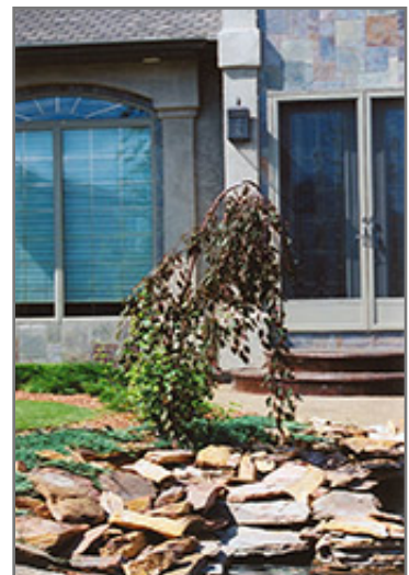
Royal Beauty Flowering Crab