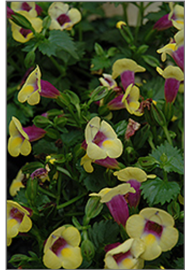
Yellow Moon Torenia flowers

Yellow Moon Torenia is recommended for the following landscape applications;