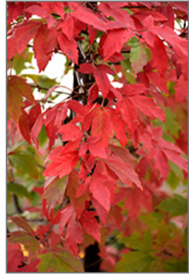
Paperbark Maple in fall

This tree does best in full sun to partial shade. It prefers to grow in average to moist conditions, and shouldn't be allowed to dry out. It is not particular as to soil type or pH. It is somewhat tolerant of urban pollution. This species is not originally from North America.