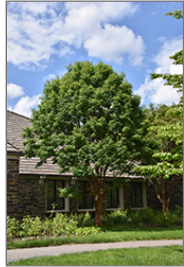
Paperbark Maple