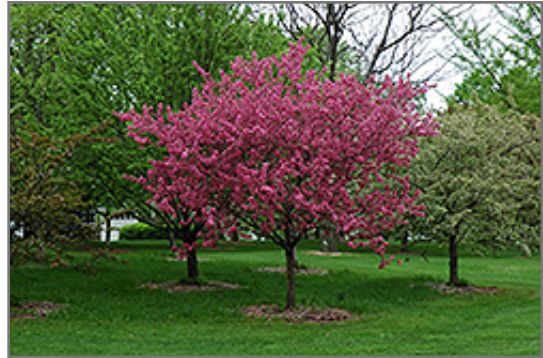
Prairiefire Flowering Crab in bloom

This tree will require occasional maintenance and upkeep, and is best pruned in late winter once the threat of extreme cold has passed. It is a good choice for attracting birds to your yard. It has no significant negative characteristics.