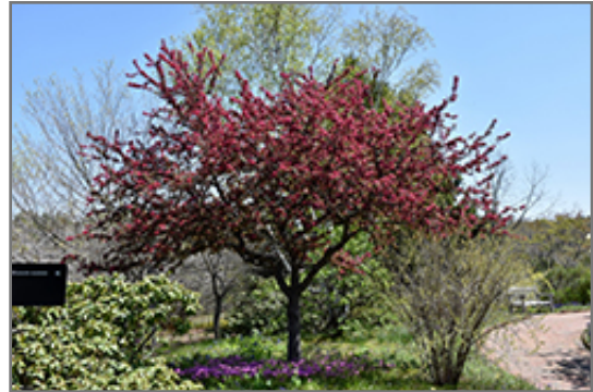
Adams Flowering Crab in bloom

This tree will require occasional maintenance and upkeep, and is best pruned in late winter once the threat of extreme cold has passed. It is a good choice for attracting birds to your yard. It has no significant negative characteristics.