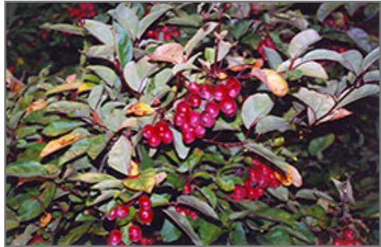
Adams Flowering Crab fruit

This tree should only be grown in full sunlight. It prefers to grow in average to moist conditions, and shouldn't be allowed to dry out. It is not particular as to soil type or pH. It is highly tolerant of urban pollution and will even thrive in inner city environments. This particular variety is an interspecific hybrid.