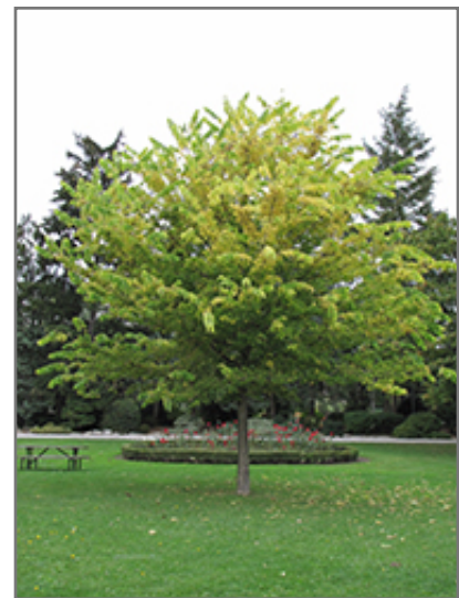
Hackberry in fall