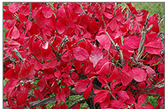
Dwarf Winged Euonymus in fall