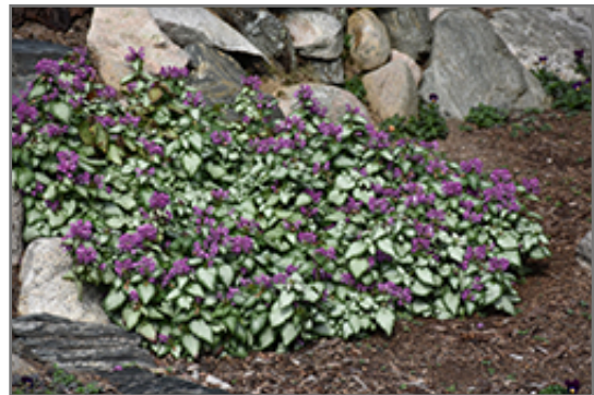
Purple Dragon Lamium in bloom