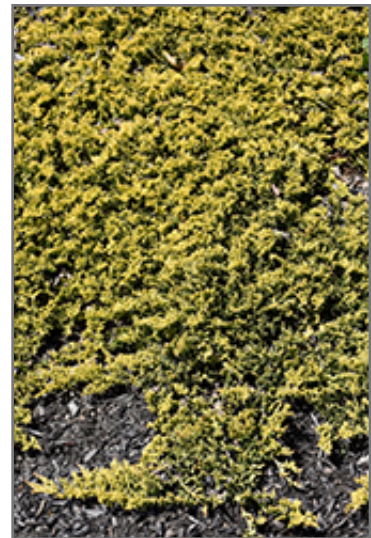
Mother Lode Juniper foliage