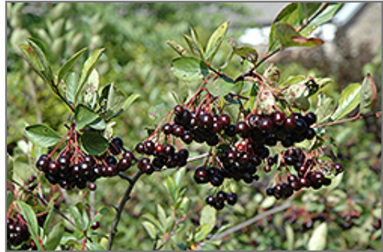
Autumn Magic Chokeberry fruit

This shrub should only be grown in full sunlight. It is an amazingly adaptable plant, tolerating both dry conditions and even some standing water. It is not particular as to soil type or pH, and is able to handle environmental salt. It is somewhat tolerant of urban pollution. This is a selection of a native North American species.