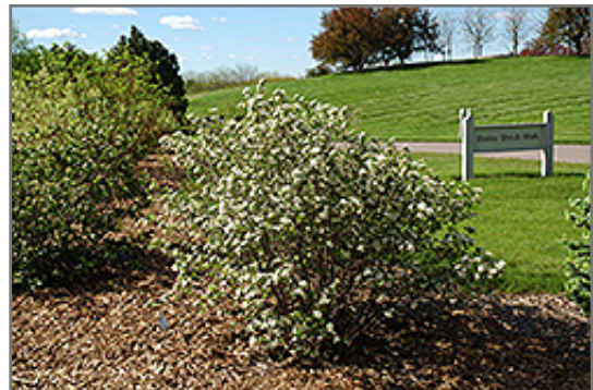
Autumn Magic Chokeberry in bloom