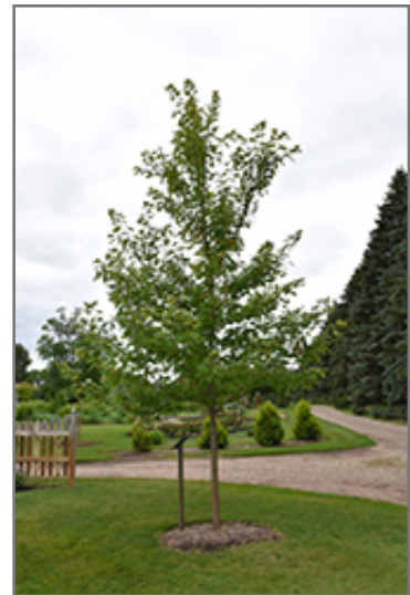
Matador Maple