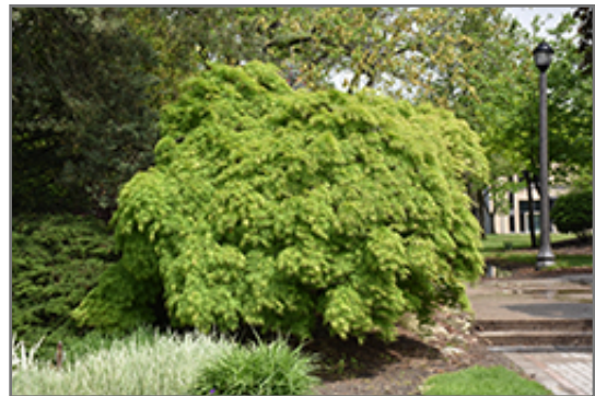
Japanese Viridis Maple