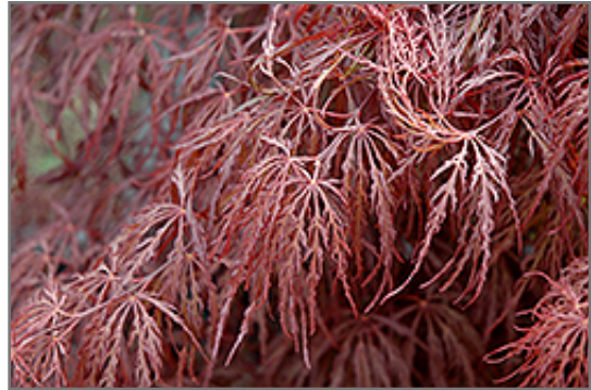
Crimson Queen Japanese Maple foliage

Crimson Queen Japanese Maple is recommended for the following landscape applications;