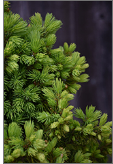
Rainbow's End Spruce foliage

This shrub does best in full sun to partial shade. It prefers to grow in average to moist conditions, and shouldn't be allowed to dry out. It is not particular as to soil type or pH. It is somewhat tolerant of urban pollution, and will benefit from being planted in a relatively sheltered location. This is a selection of a native North American species.