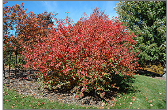
Korean Sun Pear in fall