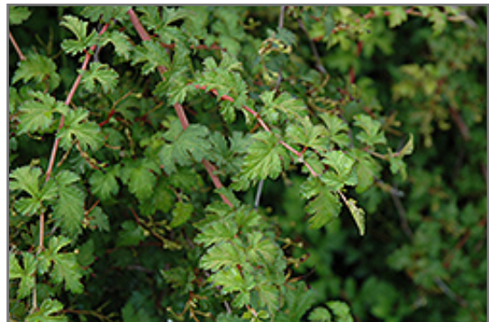
Crispa Cutleaf Stephanandra foliage