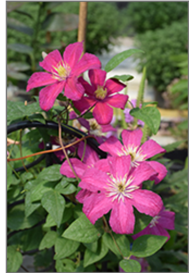
Barbara Harrington Clematis flowers Photo courtesy of NetPS Plant Finder