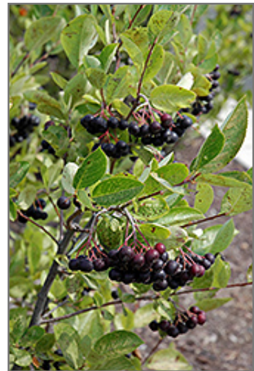
Iroquois Beauty Chokeberry fruit