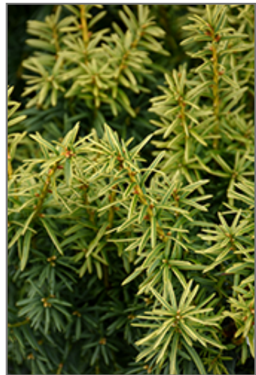
Dwarf Bright Gold Yew foliage