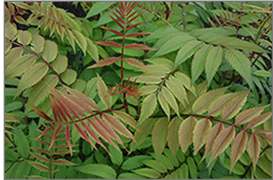
Sem Falsespirea foliage