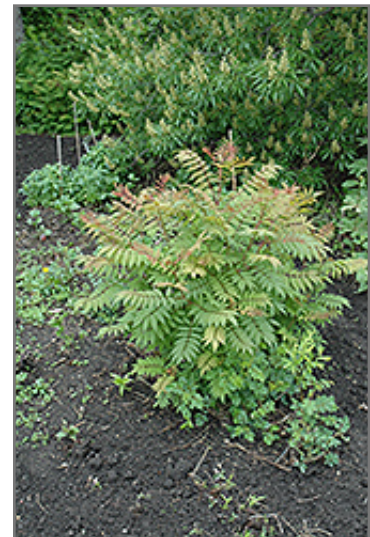
Sem Falsespirea