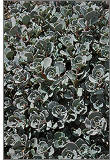
Lidakense Sedum foliage