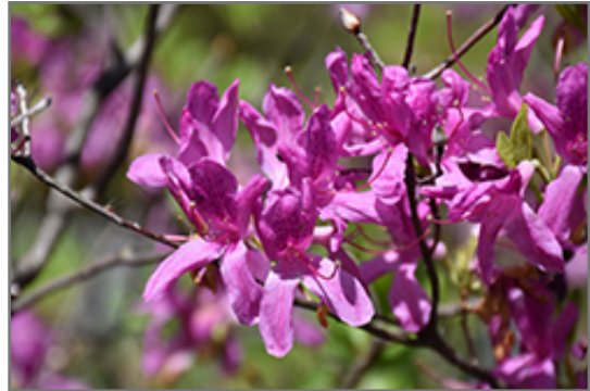
Lilac Lights Azalea flowers