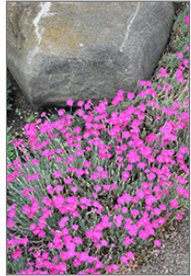
Firewitch Dianthus in bloom

Firewitch Dianthus is a fine choice for the garden, but it is also a good selection for planting in outdoor pots and containers. It is often used as a 'filler' in the 'spiller-thriller-filler' container combination, providing a mass of flowers and foliage against which the thriller plants stand out. Note that when growing plants in outdoor containers and baskets, they may require more frequent waterings than they would in the yard or garden. Be aware that in our climate, most plants cannot be expected to survive the winter if left in containers outdoors, and this plant is no exception. Contact our experts for more information on how to protect it over the winter months.