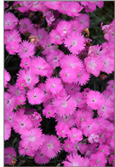
Firewitch Dianthus flowers