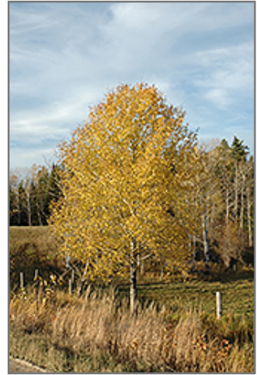
Quaking Aspen in fall

This tree should only be grown in full sunlight. It is an amazingly adaptable plant, tolerating both dry conditions and even some standing water. It is not particular as to soil type or pH. It is quite intolerant of urban pollution, therefore inner city or urban streetside plantings are best avoided. This species is native to parts of North America.