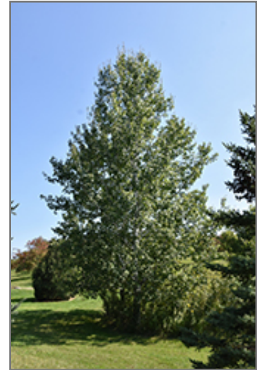
Quaking Aspen

Quaking Aspen is recommended for the following landscape applications;