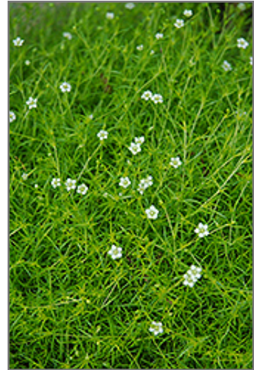
Scotch Moss flowers