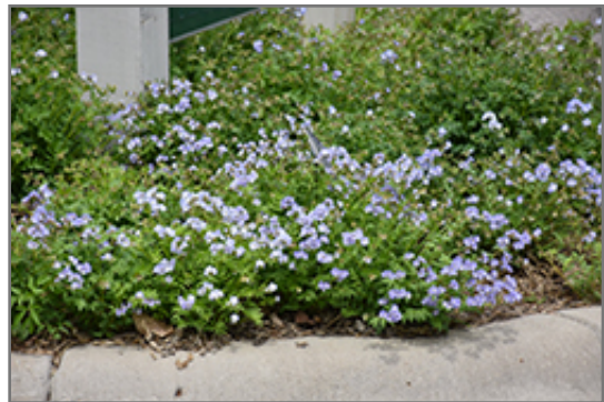
Creeping Jacob's Ladder in bloom