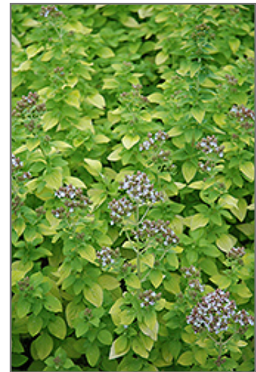
Golden Oregano flowers