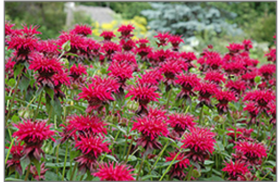
Raspberry Wine Monarda flowers