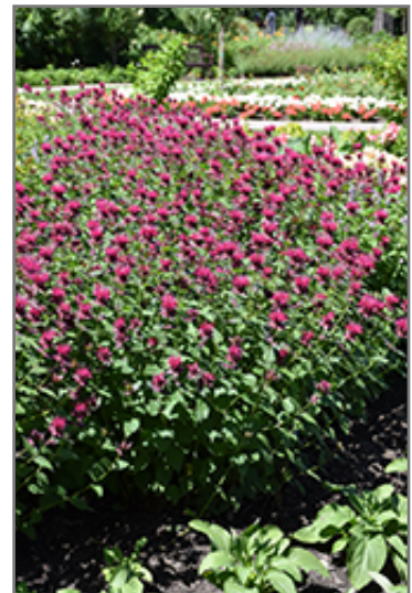
Raspberry Wine Monarda in bloom