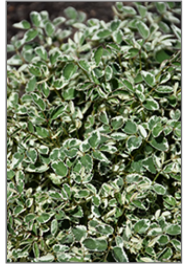
Little Angel Burnet flowers

Little Angel Burnet will grow to be only 4 inches tall at maturity extending to 10 inches tall with the flowers, with a spread of 14 inches. When grown in masses or used as a bedding plant, individual plants should be spaced approximately 12 inches apart. It grows at a medium rate, and under ideal conditions can be expected to live for approximately 15 years. As an herbaceous perennial, this plant will usually die back to the crown each winter, and will regrow from the base each spring. Be careful not to disturb the crown in late winter when it may not be readily seen!