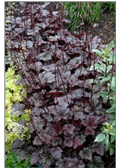
Plum Pudding Coral Bells in bloom