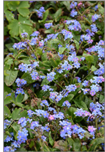
Victoria Blue Forget-Me-Not flowers

Victoria Blue Forget-Me-Not is recommended for the following landscape applications;