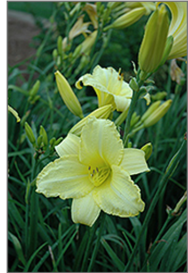
Happy Ever Appster Happy Returns Daylily flowers

Happy Ever Appster Happy Returns Daylily is recommended for the following landscape applications;