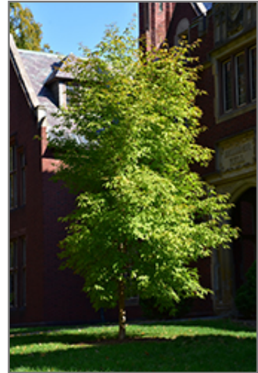
Three Flowered Maple