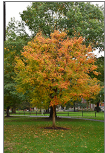
Three Flowered Maple in fall