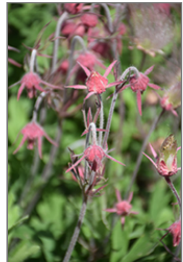
Three-Flowered Avens flower buds