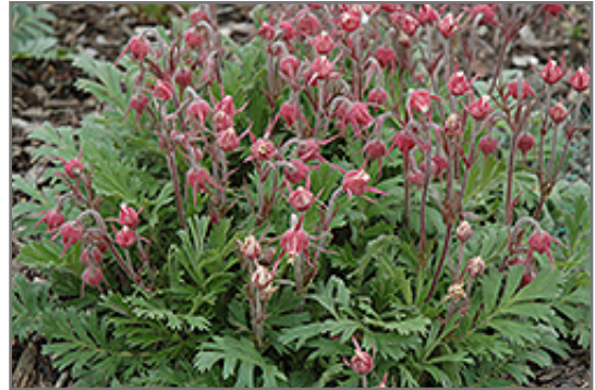
Three-Flowered Avens in bloom

Three-Flowered Avens is recommended for the following landscape applications;