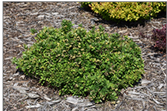
Moscato Barberry