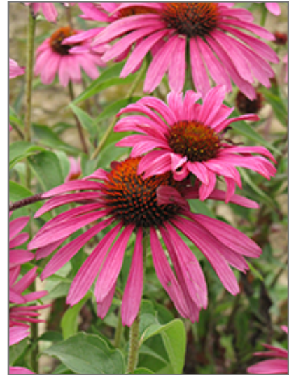
Ruby Star Echinacea flowers