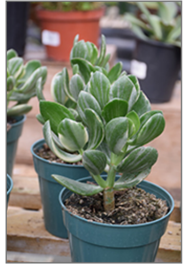
Variegated Jade Plant in full

This is a multi-stemmed evergreen houseplant with an upright spreading habit of growth. This plant can be pruned at any time to keep it looking its best.