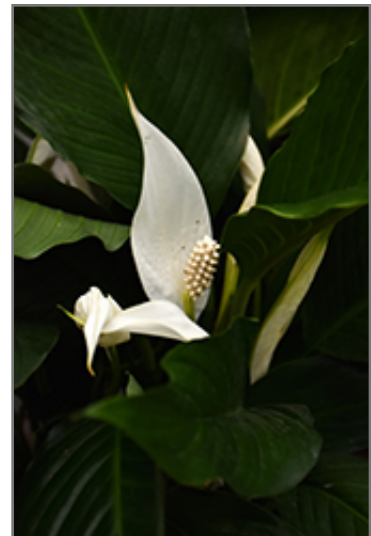
Peace Lily flowers