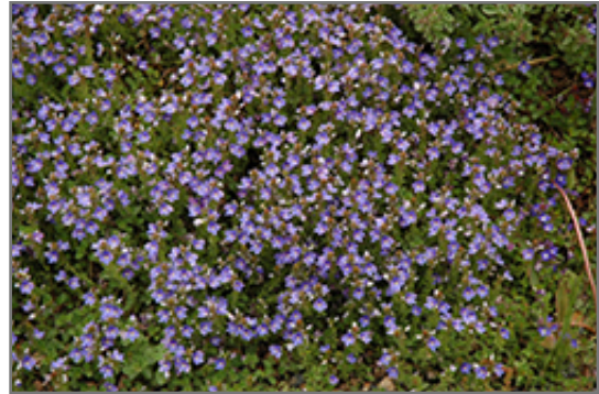
Turkish Speedwell in bloom

This is a relatively low maintenance plant, and should only be pruned after flowering to avoid removing any of the current season's flowers. It is a good choice for attracting butterflies to your yard, but is not particularly attractive to deer who tend to leave it alone in favor of tastier treats. It has no significant negative characteristics.