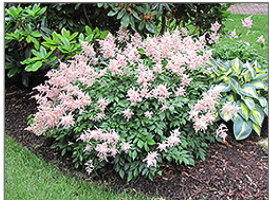
Peach Blossom Astilbe in bloom